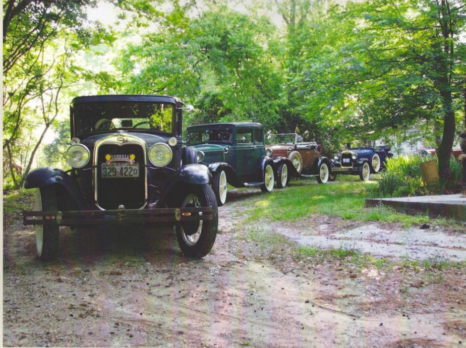
Southside A's 2012 Calendar